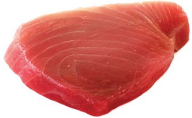
Tuna - one of the meats often treated with CO to preserve its bright color.

The current GRAS process results in a strange legal gray area for substances granted the designation. They are not approved as GRAS, although the agency treats them as such. The public has had no opportunity to comment on their safety or express its health concerns. Most impor-